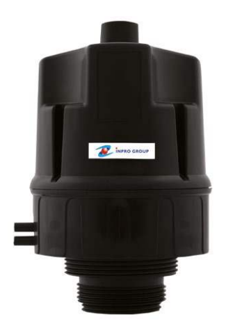
* Magnetic activation point or 'Hot-spot'